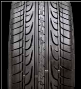
Dunlop SP Sport Maxx

Please note: Maintenance, service or expendable parts such as Tyres are covered for manufacturer's defects but are not covered for wear as they are a normal maintenance item.