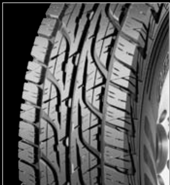
Dunlop Grandtrek AT3